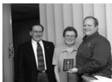
Family of the Year