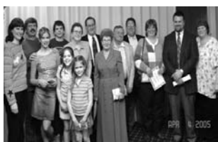
Families of the Month