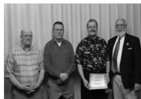
Knights of the Month