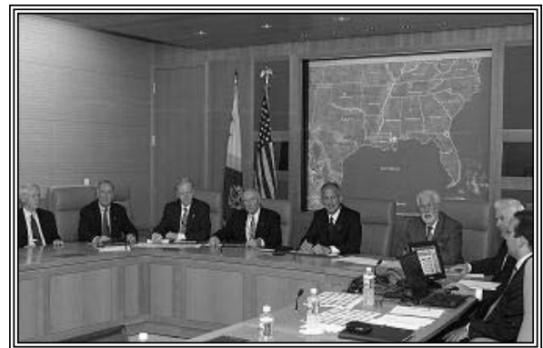
Supreme Officers discuss relief efforts on a conference call with state deputies from affected areas and throughout North America.

The Knights of Columbus has also announced that it will be suspending lapses of policies and premium notices in FEMA-designated disaster areas for at least 60 days. Knights of Columbus is ranked by Fortune Magazine as one of the largest providers of life insurance in the country with over $54 billion of top rated life insurance in force.