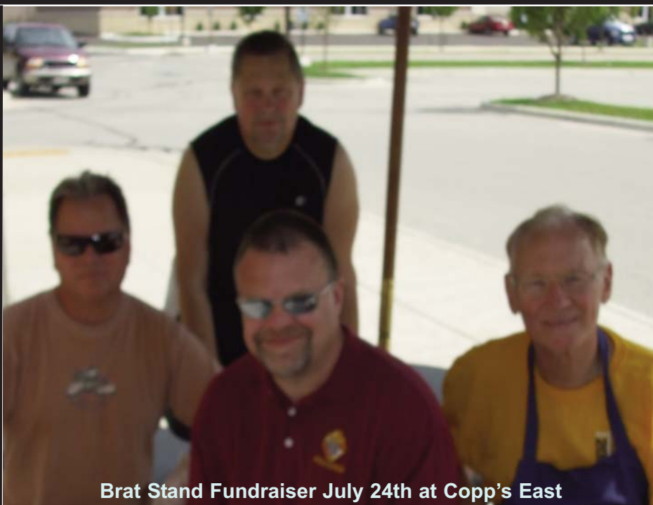
Brat Stand Fundraiser July 24th at Copp's East